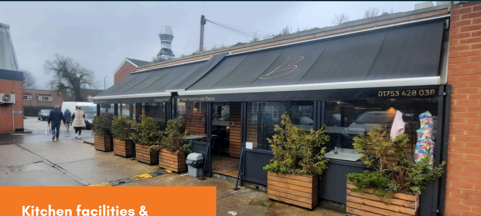
Kitchen facilities & Food preparation area