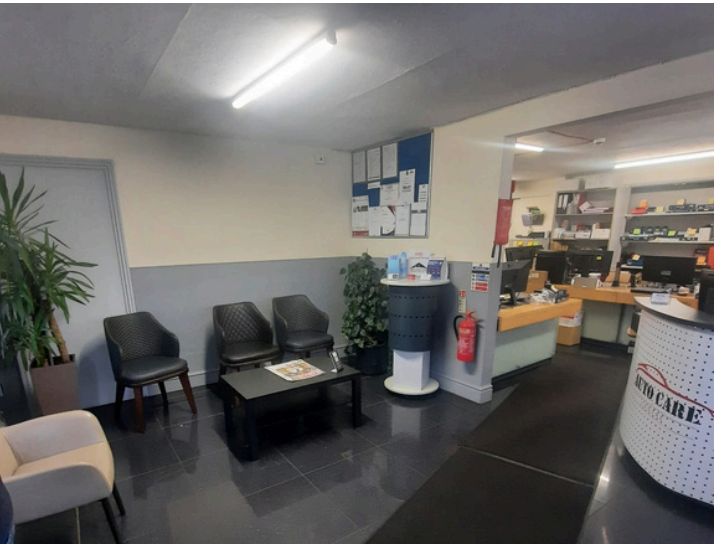
Office & customer reception area

Situated on Maidenhead Road, this site is 0.8 miles from Windsor & Eton Central Train Station and 1.4 miles from The M4 (Junction 6).